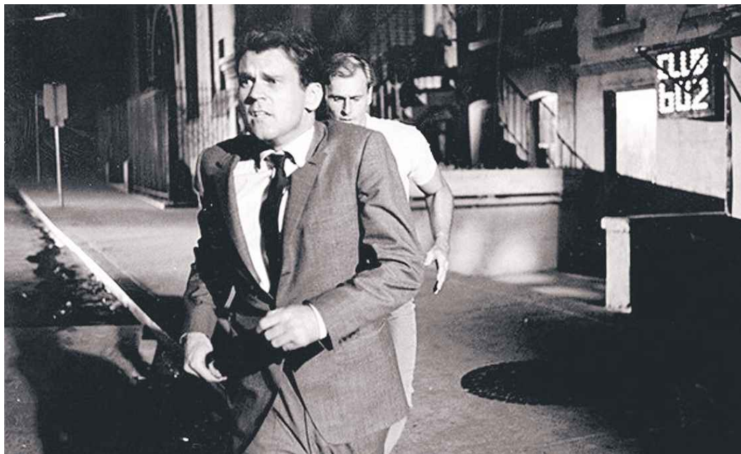
Top, "The Hoodlum Priest" (1961) was Murray's first independent production and his favorite among his many films. In Otto Preminger's "Advise and Consent" (1962), bottom, which was filmed on location in Washington, Murray played a Utah senator under threat of blackmail.