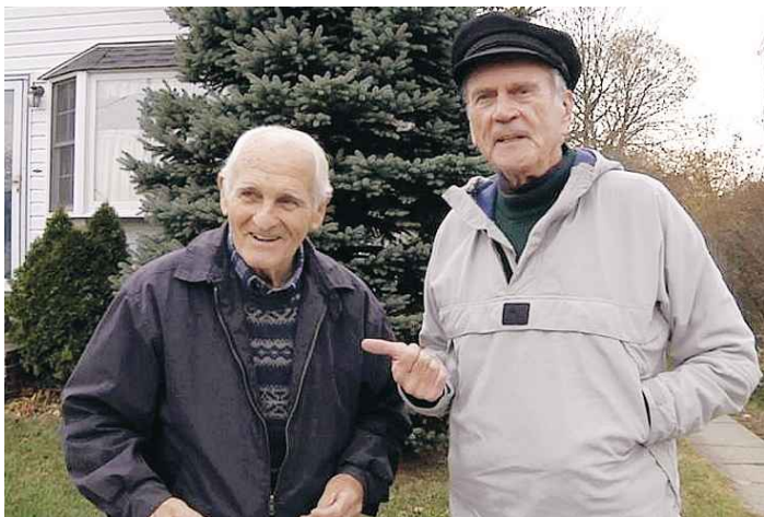
Murray reunited with an East Rockaway classmate during filming.