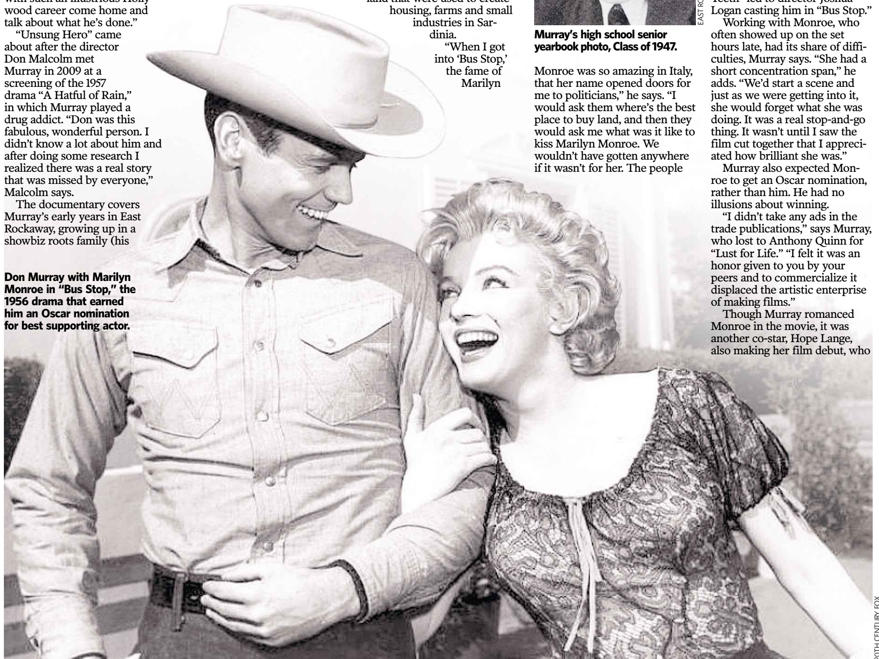
Don Murray with Marilyn Monroe in "Bus Stop," the 1956 drama that earned him an Oscar nomination for best supporting actor.

Though Murray romanced Monroe in the movie, it was another co-star, Hope Lange, also making her film debut, who